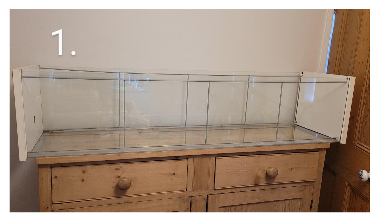
Photo 1: You can buy this Ikea Detolf direct from Ikea online. There are online YouTube tutorials of how to make lids or several Etsy or Facebook sellers who can make these for you. Tank Dimensions are 163cm (L) x 43 (W) x 37 (H) When getting your tank ready, clean it with a pet safe disinfectant.

When constructing a new tank, always add about 20% of your Gerbils old bedding, they are scent based so like to feel familiar in their environment. The accessories are all wooden, never used plastic as it can be fatal if ingested.